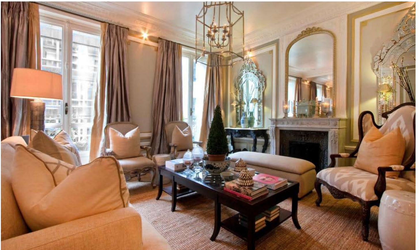
Paris living room

Those considering an investment in the Capital Fund should note that a few Units remain at the Premium Shareholder's discounted price of €110,000 – approx. £91,600 now in sterling. A fully-refundable deposit cheque for £5,000, payable to Rocksure Property Clients' Call Account and sent to Amanda Gray at the Burford office, will secure one of these Units (and the discount) for you, provided that a full subscription follows when required.