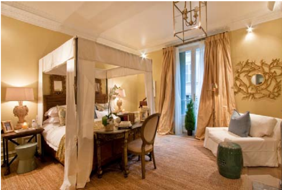
Paris Master bedroom