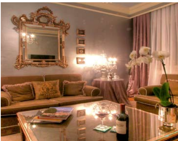
Florence living room

Please don't forget that Shareholders may make bookings NOW for the lovely penthouse apartment in Florence, shown in the two photographs below. It has a private terrace directly overlooking the Ponte Vecchio and the Arno River.