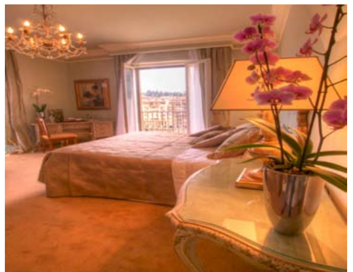
Florence Master bedroom