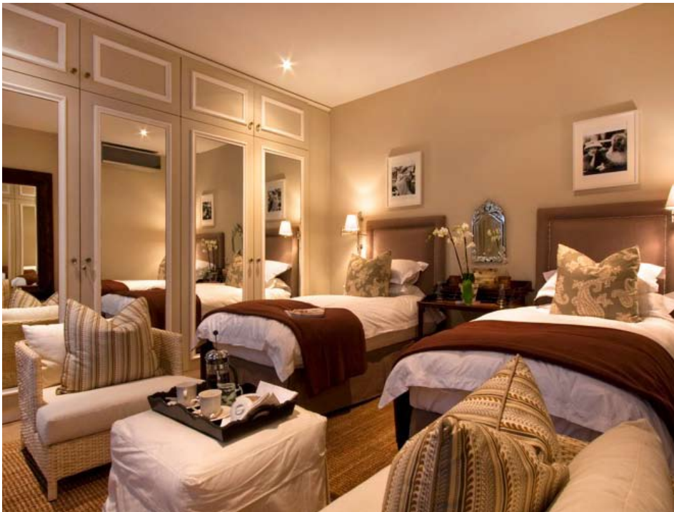
Paris second bedroom