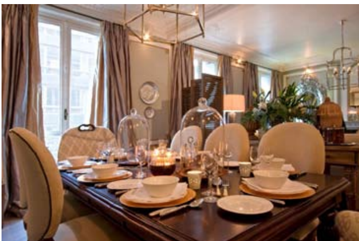
Paris dining area