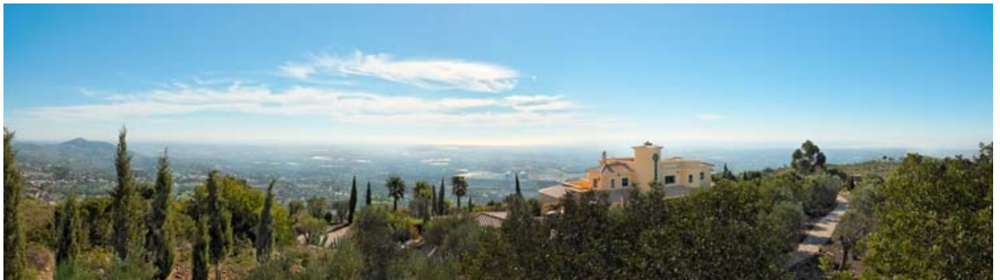
A Rocksure Gold House in The Algarve

Rocksure Gold is likely to be the standard of all future funds 'though, every now and again, a Platinum Fund may be introduced to reflect higher property values. The first of these is the Quintessentially Rocksure Platinum Fund, which will own 5 houses averaging over £2 million in value.